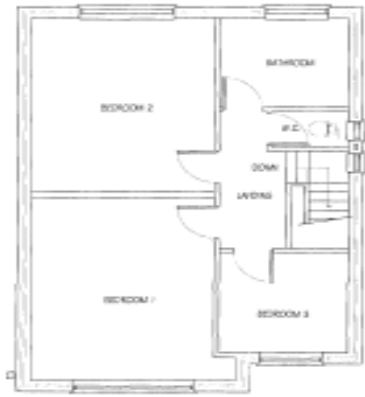
FIRST FLOOR PLAN - EXISTING 1:80