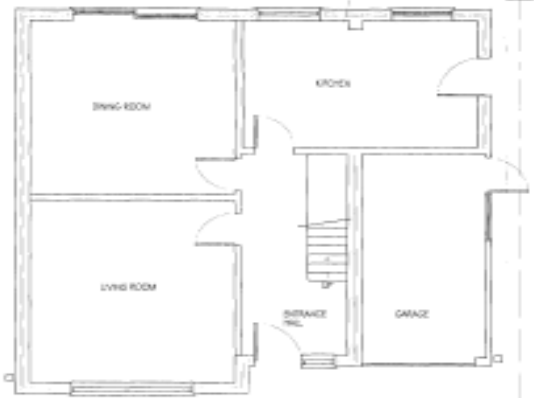
GROUND FLOOR PLAN - EXISTING 1:80